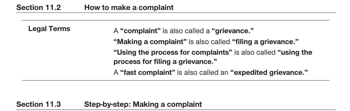
Step 1: Contact us promptly – either by phone or in writing.